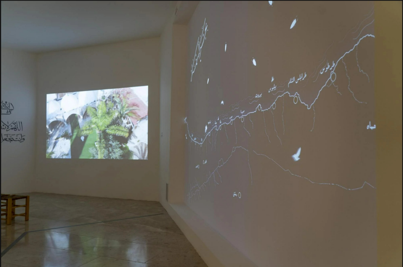
Throughout the exhibition, interactive elements are used to explore key themes around the Palestinian coast. One map presents animated infographics about the booming agricultural trade in the Mediterranean from the 18th century until the beginning of the 20th century.