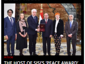
Article THE HOST OF SISI'S 'PEACE AWARD'