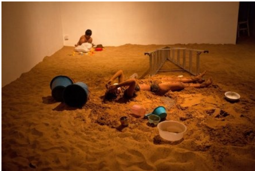
Tith Kanitha, Heavy Sand, 2012.