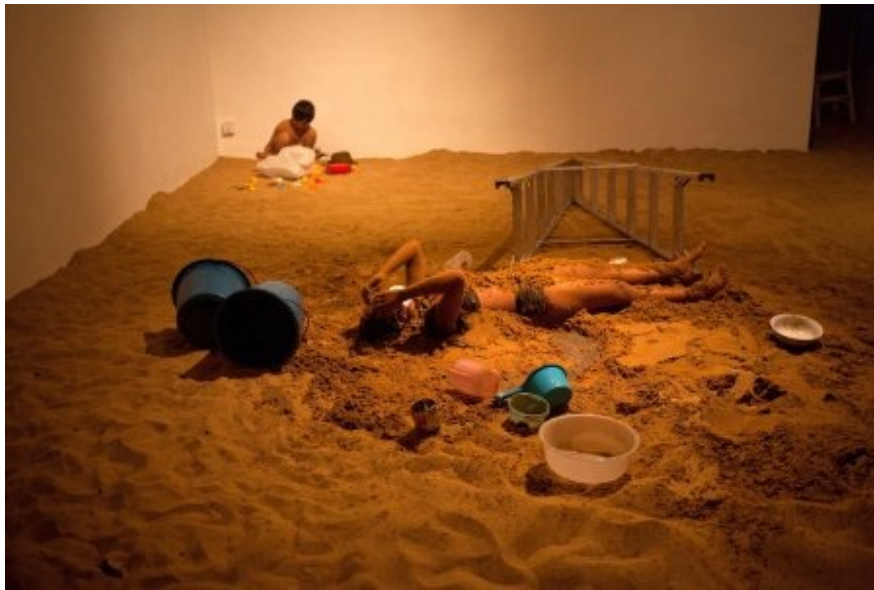
Tith Kanitha, Heavy Sand, 2012.