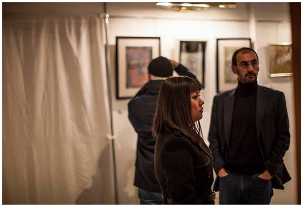
Opening of "Attualità Indonesiane" at Il Ramo D'Oro, Naples