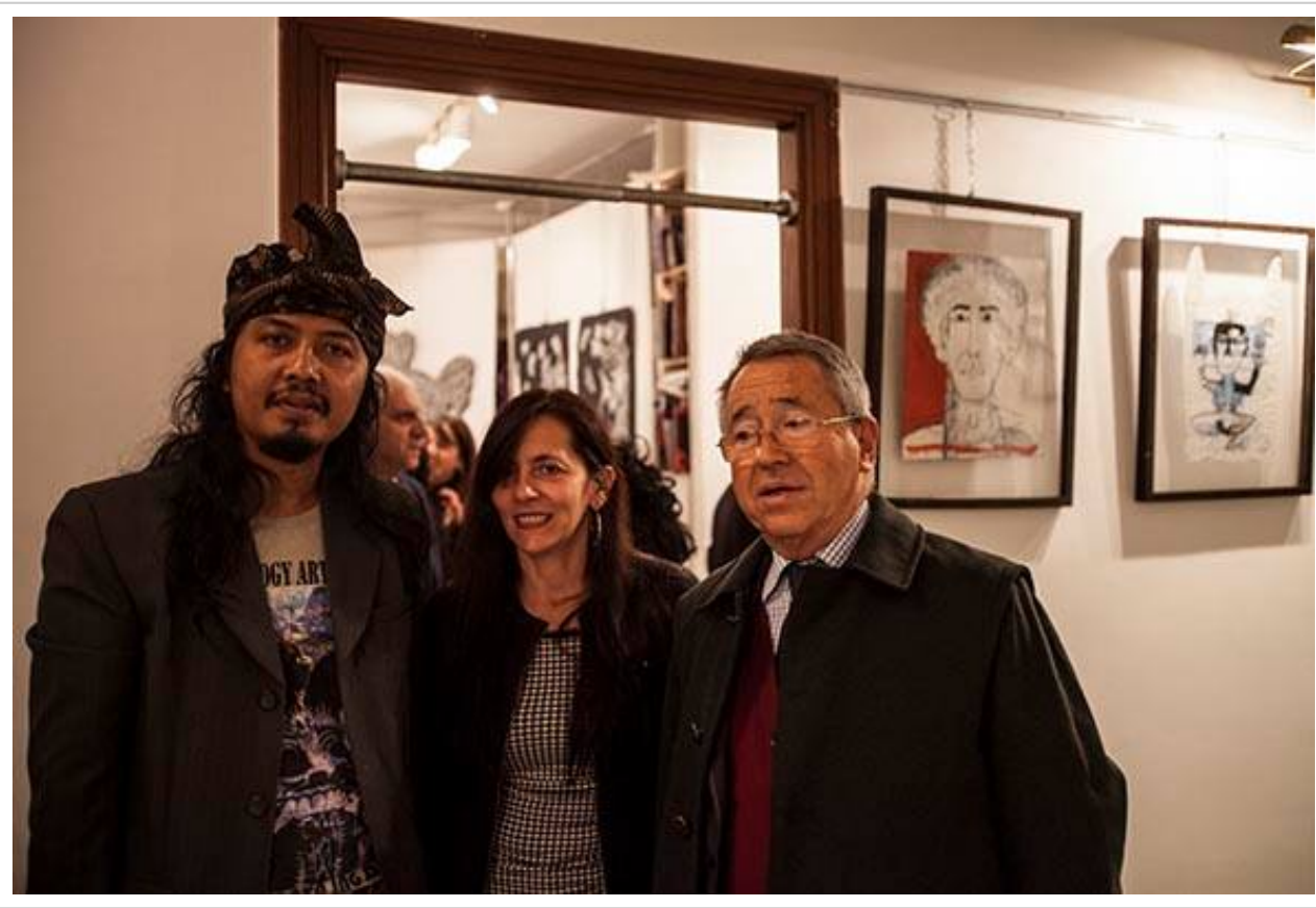
Opening of "Attualità Indonesiane" at Il Ramo D'Oro, Naples