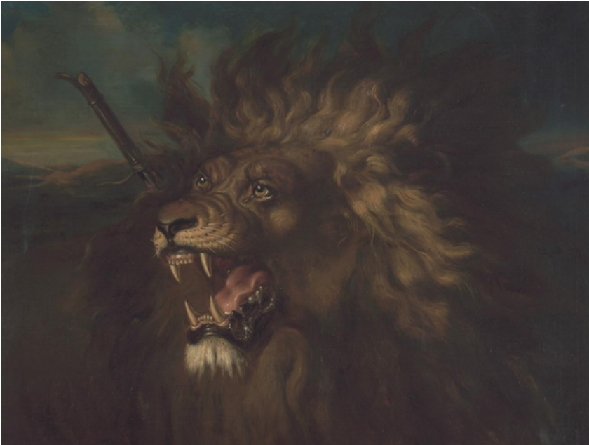
Raden Saleh, Wounded Lion

By observing side to side masterpieces of Indonesian Raden Saleh to the Filipino Juan Luna, one can see similarities and differences. These are to find not only in the work of the two artists, but also in the attitudes of the two countries towards a number of issues, notably colonialism.