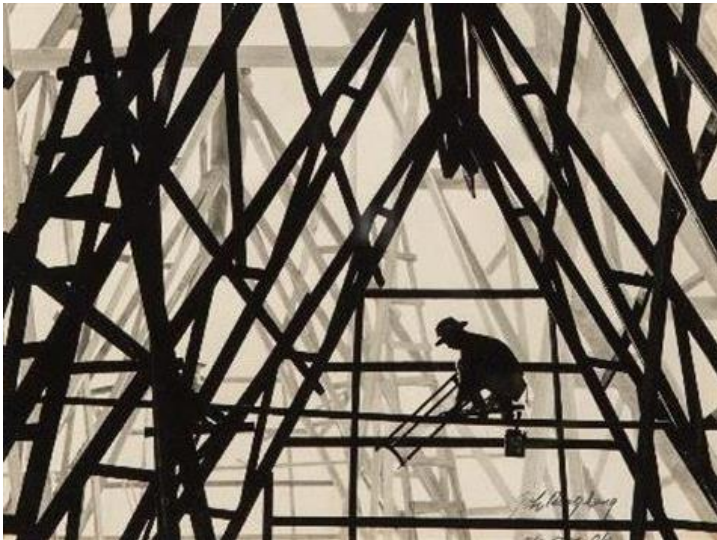
Wu Peng Seng, Construction (Detail)

South East Asia's big new gallery opens next week in Singapore. ArtsHub gets a sneak preview.