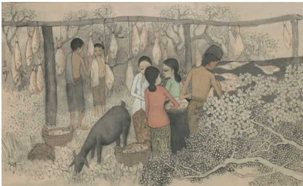
Cheong Soo Pieng, Drying Salted Fish